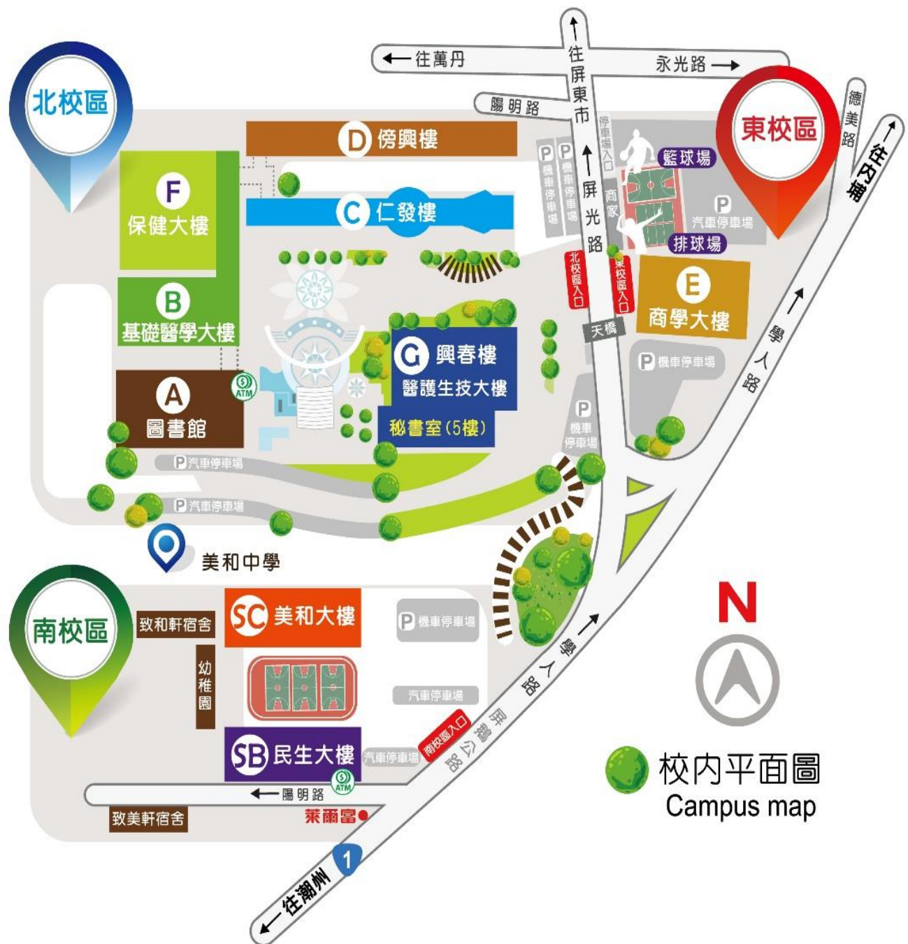
校內平面圖 Campus map