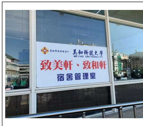
致和軒 Dormitory for male students