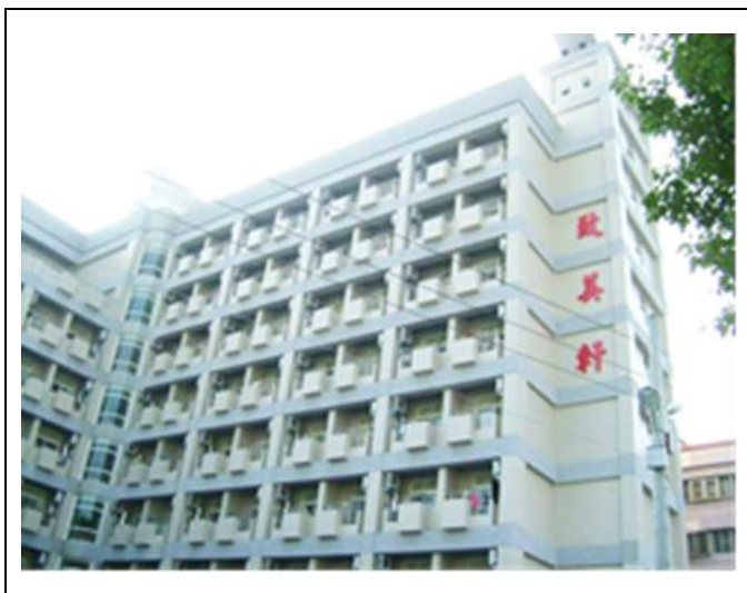
致和軒 Dormitory for male students